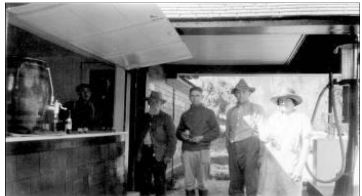
Gas Station Opening Day—May 12, 1927