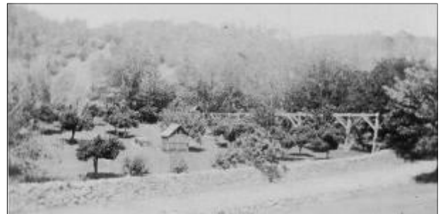
Flume to deliver Kentucky Creek water to field