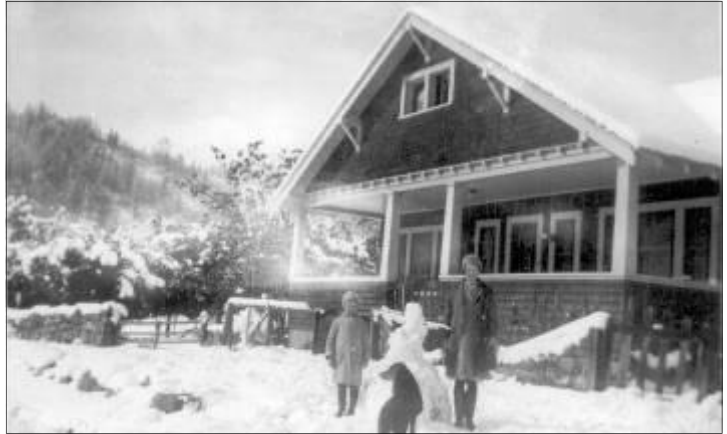
1919-1956 Kneebone House