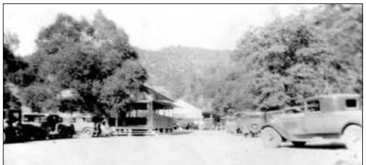
Open-air Dance Pavilion and Dining Hall