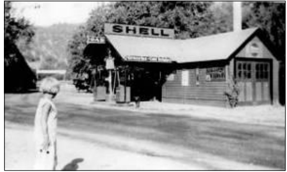
1930s Gas Station & Alfrieda Kneebone

The swimming resort opened June 12, 1927 with a beef barbeque and a dance on opening day. The area upstream (now called Kneebone Beach) featured a swimming hole, two diving boards, beach, changing rooms, showers, dining hall, a cement block cave in the hillside to