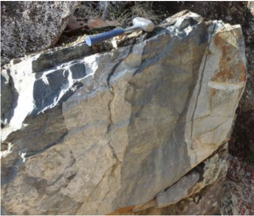
Dark colored dike that intruded light-colored plutonic rock

All of the bedrock at South Yuba River State Park is considered by geologists to belong to the Smartville Complex, an assemblage of genetically related rocks formed late in the Jurassic period, about 160 million years ago (Day and Bickford, 2004). The oldest rocks of the Smartville Complex are volcanic, although remnants of actual volcanoes are not preserved. These rocks were subsequently intruded (invaded from below) by plutons (large bodies of buoyant molten rock). As the plutons were emplaced into the Earth's crust, the overlying (older) rocks fractured. Magma was then able to further rise, filling the fractures, and cool. Rocks formed in this way